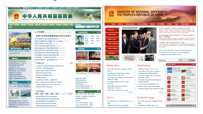
Figure 2 Comparing China's Chinese and English websites

While Brazil, Russia, and India do not completely fit the suggested classification, China provides the strongest differences, most notably against USA. Brazil and Russia have English translations of their websites translated using Google and reflect the original layout, agreeing with Robbins and Stylianou [14]. China has websites reflecting the US website structure for their English versions, significantly different from the Chinese version, as shown in Fig 2. We believe that this is an important evidence to show how one culture (Chinese) finds it imperative to change its look to control the perception by others. On the other hand, it might be possible that the English webpage is newer and is hence designed using newer technologies. However, both the websites show the usage of exactly the same technologies: HTML, CSS, AJAX, and FLASH.